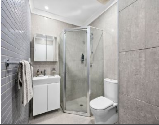
29/303 Miller Street Cammeray, NSW